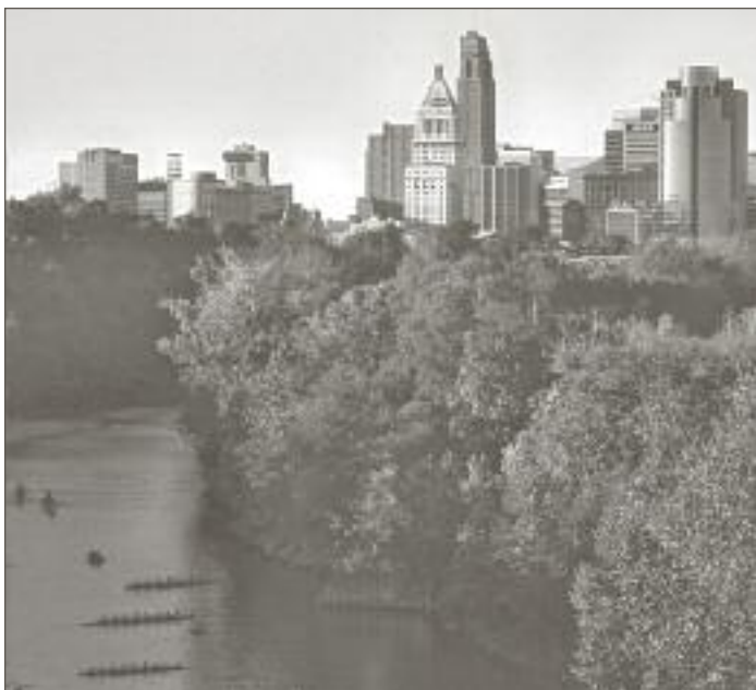
Cincinnati lies on the northern banks of the Licking River, which is popular with rowers and scullers (bottom left).

In a July 2009 article, the New York Times complimented Cincinnati USA on its “artsy swagger,” paying homage to a vibrant arts and culture scene that rivals those of New York City, Chicago, and Los Angeles. Anchored by the Cincinnati Art Museum, Cincinnati Symphony Orchestra, and Playhouse in the Park, the region also boasts the Cincinnati Ballet, Cincinnati Opera, Contemporary Arts Center, May Festival, and the Taft Museum of Art. Visitors can explore everything from the sprawling National Underground Railroad Freedom Center to the quaint art galleries in the Mt. Adams and O’Byronville neighborhoods.