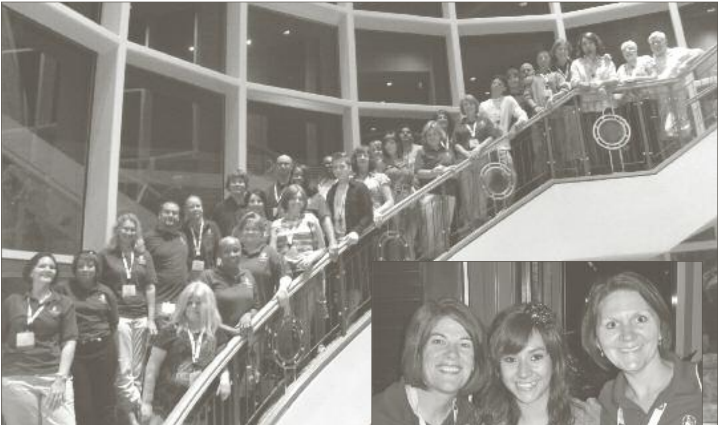
Shriners Hospital-Cincinnati staff and families at the 2010 WBC Kick-off Event in Galveston, Texas.