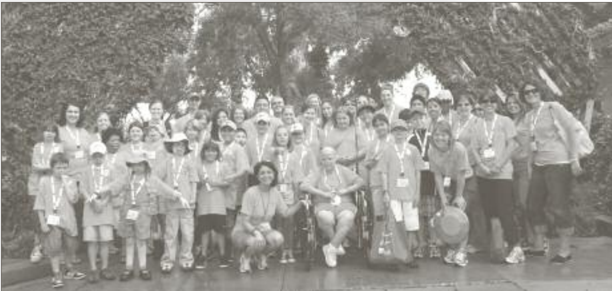
Participants in WBC 2010 UBelong and their support team.