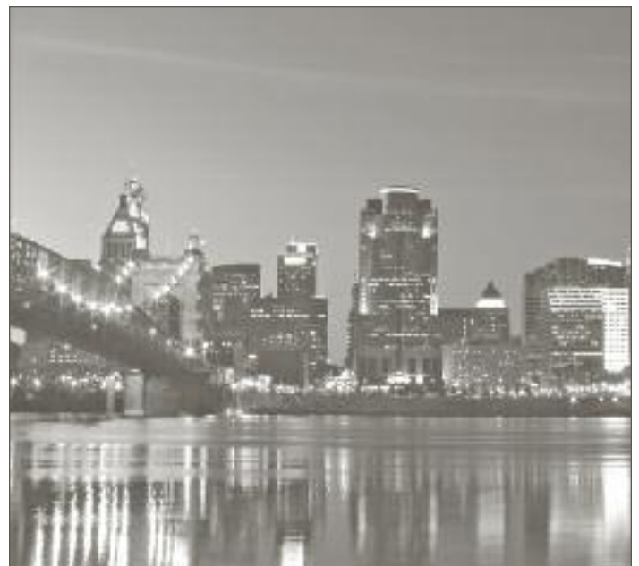
A bright skyline beckons drivers crossing the Roebling suspension bridge, a national historic landmark.