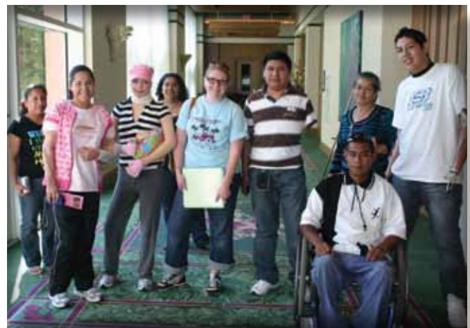
Teenagers participating in the UBelong program