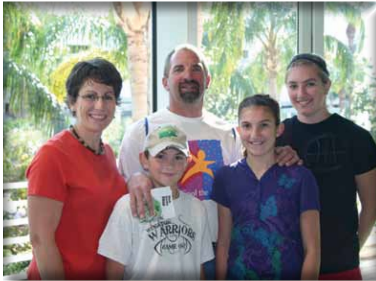
The TeKrony Family at World Burn Congress 2010

People who suffer burn injuries often have a challenging time getting back to living. The Phoenix Society for Burn Survivors helps them do exactly that. We are the only national non-profit organization helping survivors meet their challenges with the community support and the tools they need to thrive again. The Phoenix Society, based in Grand Rapids, Michigan, takes its name for the legendary bird that is consumed by flames, but rises again, more vibrant than before.